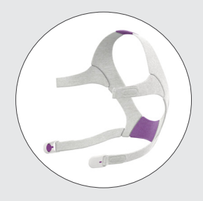
N20 for Her headgear with headgear clips 63558 (S)